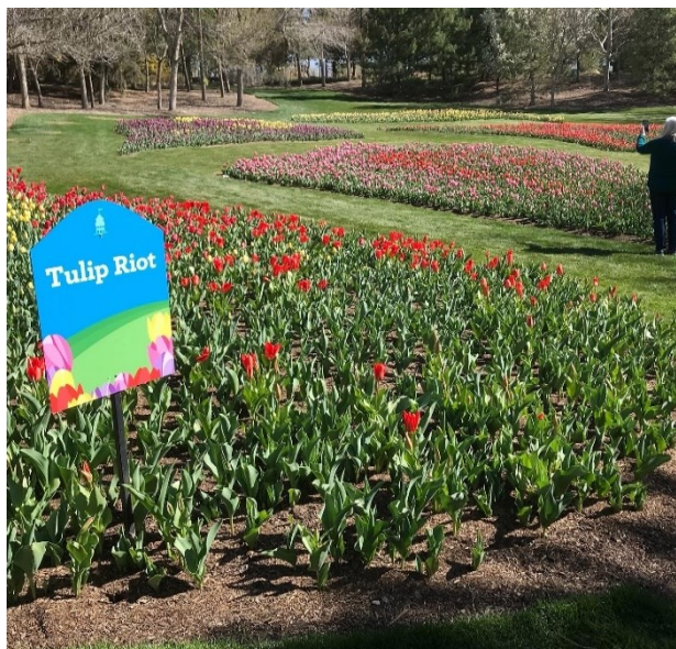
Tulip Festival at Ashton Gardens