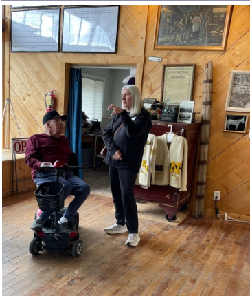
Herb & DJ sharing.

Behind the group is the canyon where the flume was originally built. It ran 12 miles