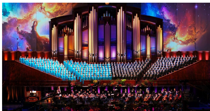
Tabernacle Choir Practice