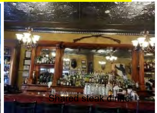
Shared steak dinner