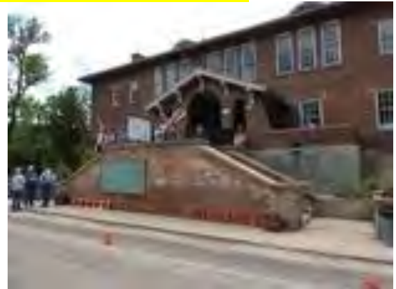
John Voight who bought the whole village, lectured to a large crowd seated in front of the YMCA