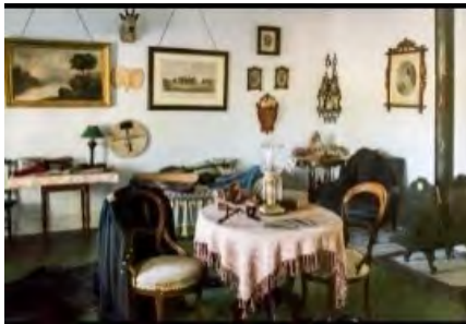
Captain's Living Quarters