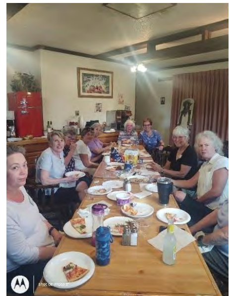
Happy Hour with Pizza at the Bunk House Motel in Guernsey