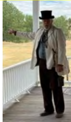
Our guide from the 1800s made the tour more enjoyable