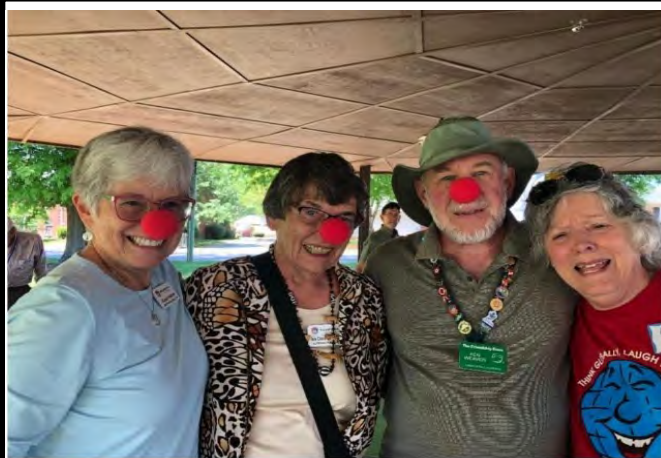
Quite a contrast from May of 2020 Newsletter!!