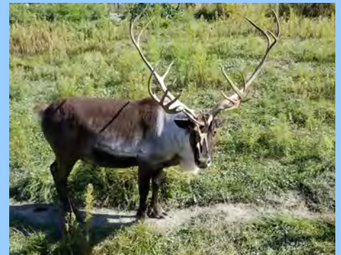
Elk with deformed antlers