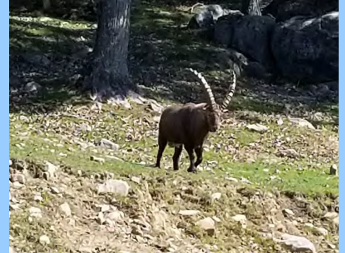
Ibex in Parc Omega