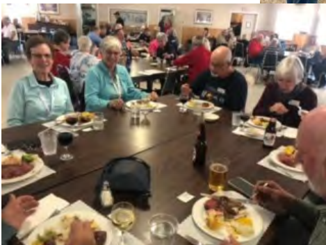
Cruise on Lake Rosseau