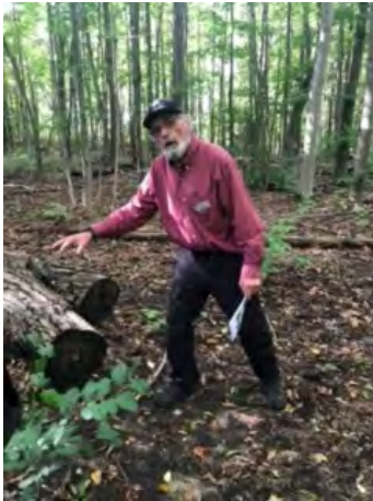
Rain in the logging camp in Algonquin Park

Our Journey to Lake Simcoe and Ottawa was just outstanding. We are excited to share detail of it when we present to the club, but here are a few highlights and photos to give you a preview.