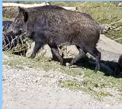
Wild boar can bear 60 babies per year