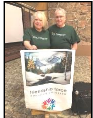
Clothing from travels!