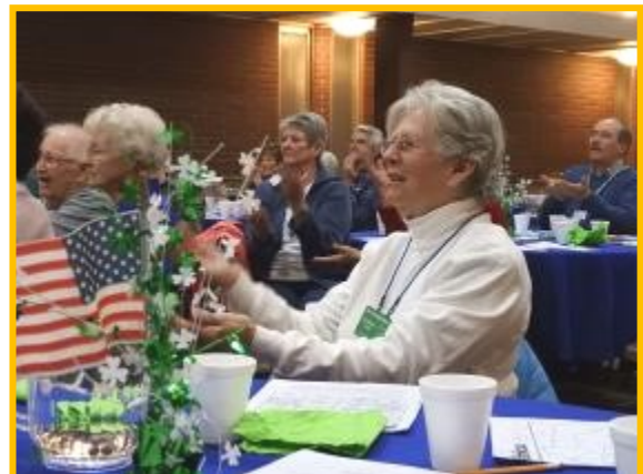
Audience participation with Hand Dancing to African rhythms!