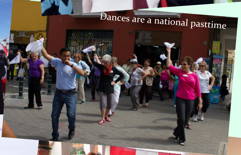
Dances are a national pasttime