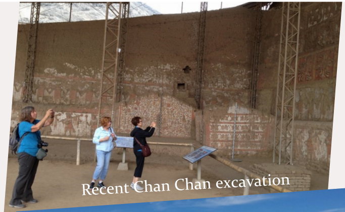
Recent Chan Chan excavation