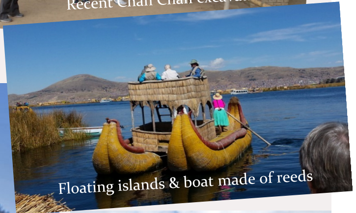
Floating islands & boat made of reeds