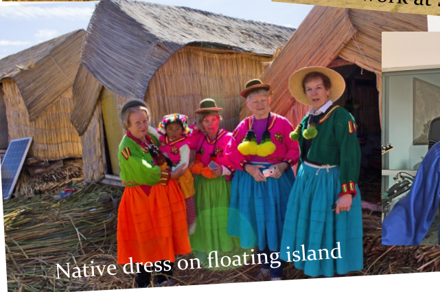
Native dress on floating island