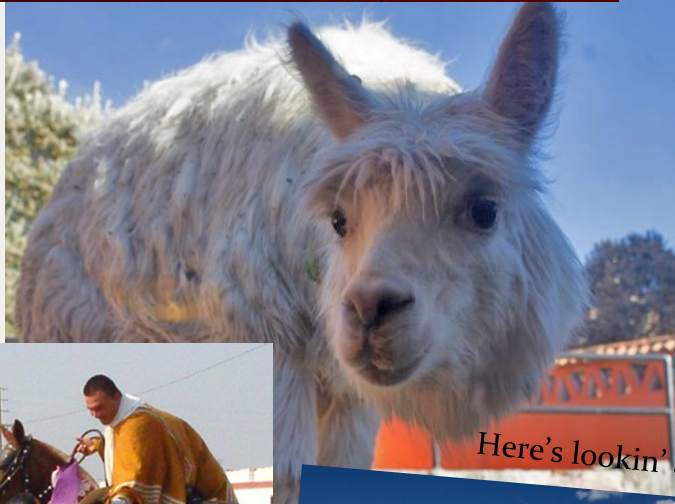
Here's lookin' at ya