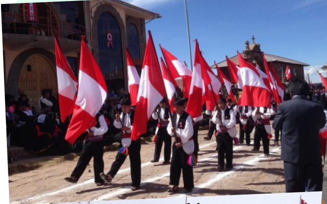
Parades are big