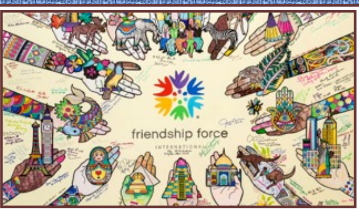
Large poster colored by FF members attending