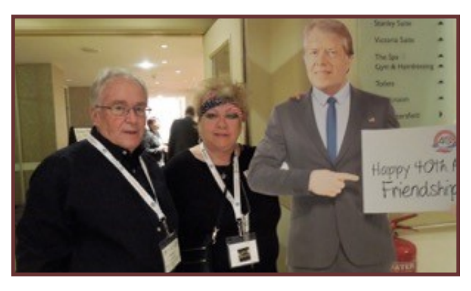
Banquet under the Concorde