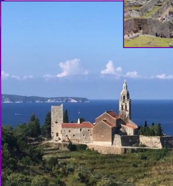
Church in Komiza, Island of Vis, Croatia