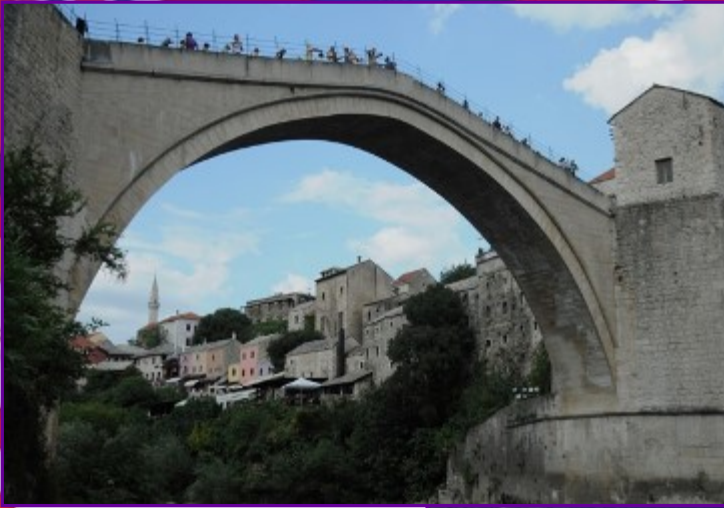
Old Bridge in Mostar, Bosnia & Herzegovina