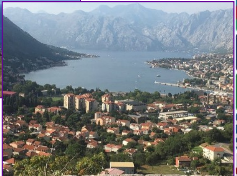
View of Kotor, Montenegro