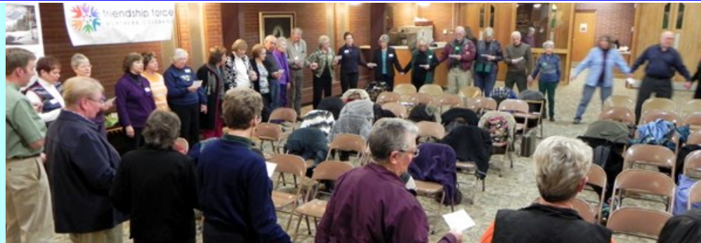
Singing: “..let there be peace...”