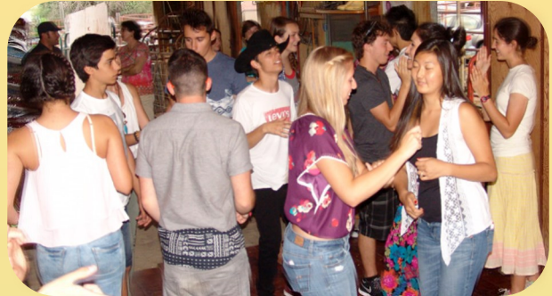
Compass USA students, from Madrid, Spain, as they enjoy a barn dance last July at a local Loveland farm.