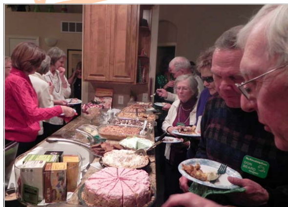
Ooh, look at those desserts!