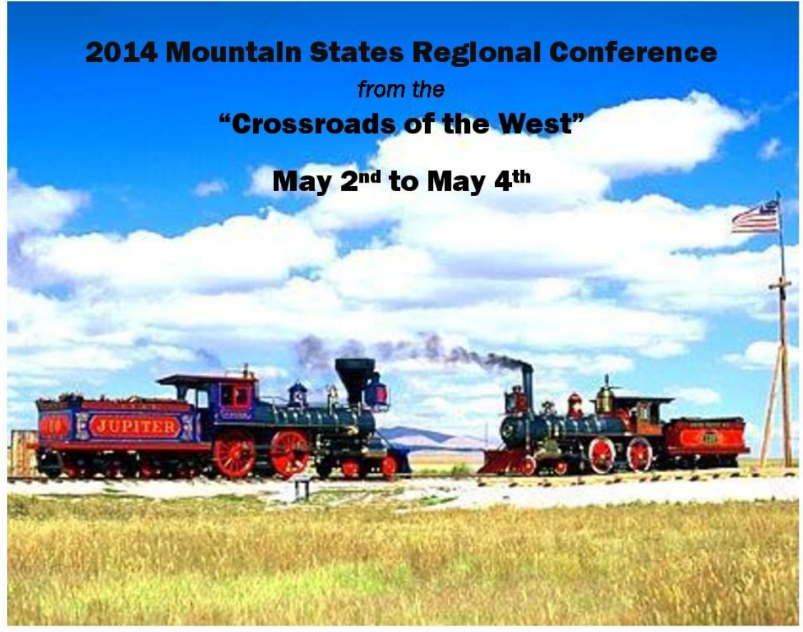
Golden Spike National Historical Park