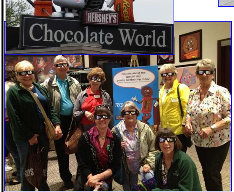
Good Times at Hershey's