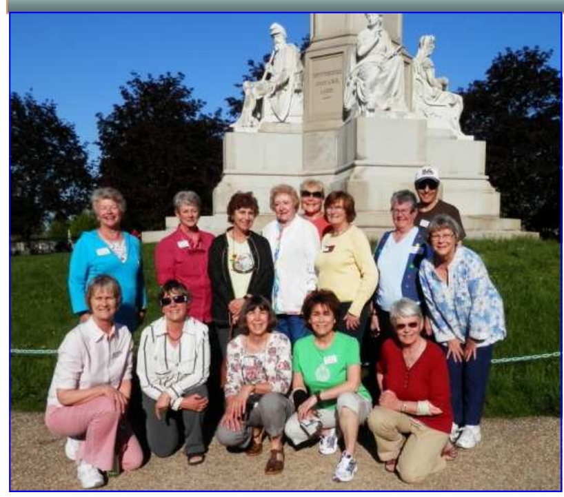
Monument at Gettysburg National Cemetery