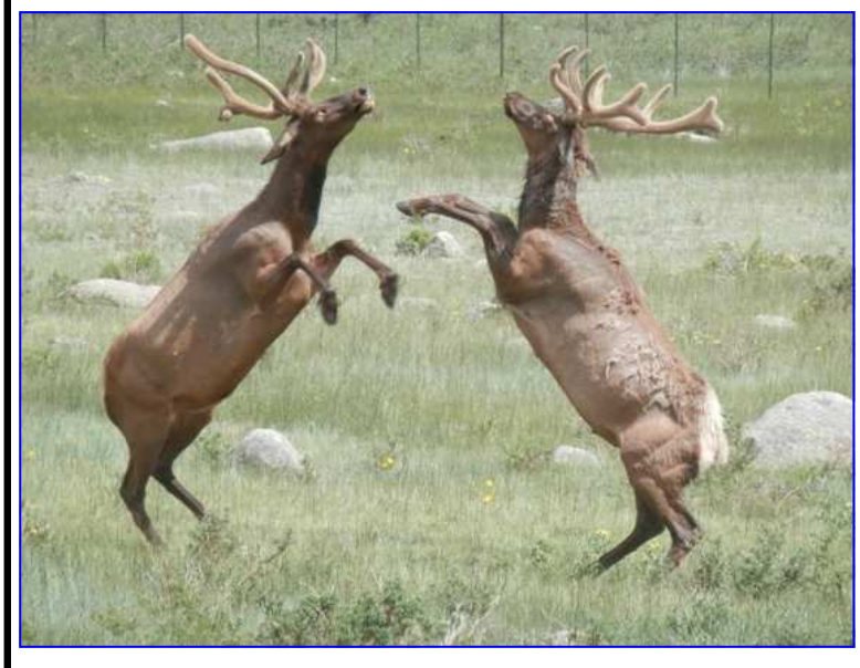
Two bull elk in RMNP compete for leadership of the herd