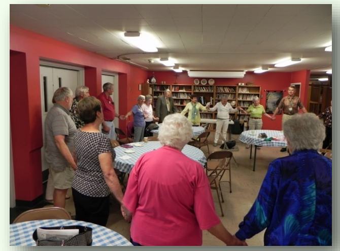
Let there be peace on earth...