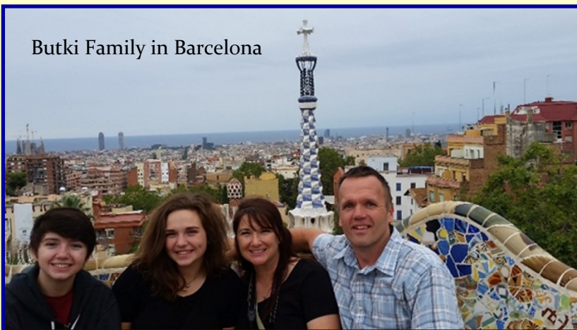
Butki Family in Barcelona