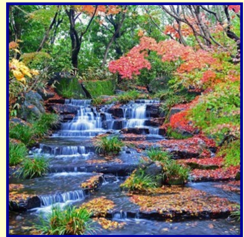
K O B E J A P A N