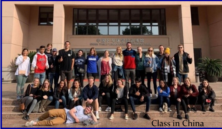
Class in China