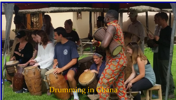
Drumming in Ghana