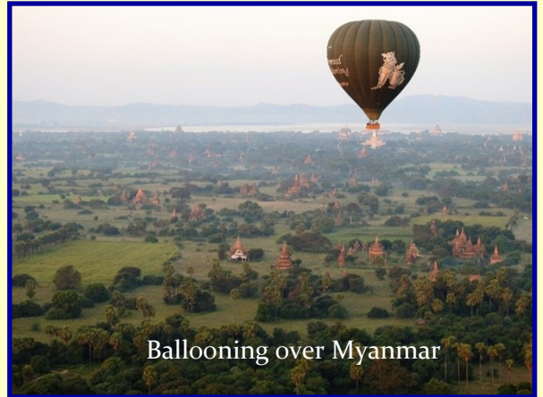
Ballooning over Myanmar