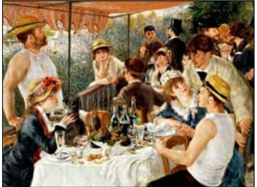
Alas, the wine pictured in this famous painting is not allowed at our park.

Our club will furnish chicken, and if each of you FFNC members can please bring a side, our guests from Cheyenne will bring the deserts. Bone up on your Friendship Force knowledge for a little competition/education. We'll bring some lawn games for all to enjoy.