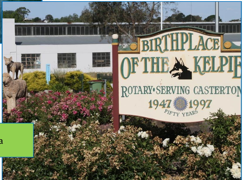
Casterton, Victoria, Australia