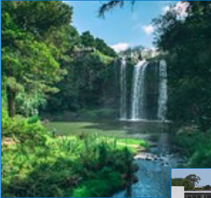
Whangarei, New Zealand known as "The Land of the Whales"