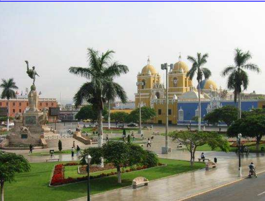
Plaza de Armas in Trujillo, Peru

Contact Alice Gibson at 970 310-8848 aligibsc@gmail.com