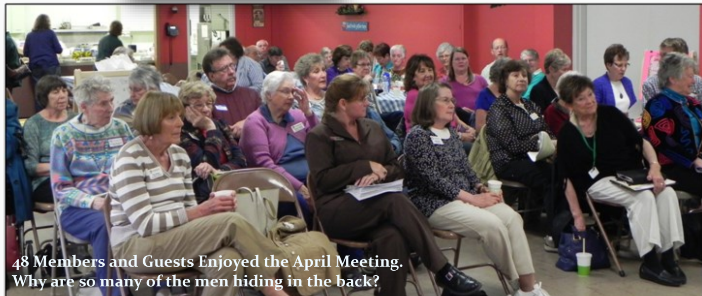
48 Members and Guests Enjoyed the April Meeting. Why are so many of the men hiding in the back?