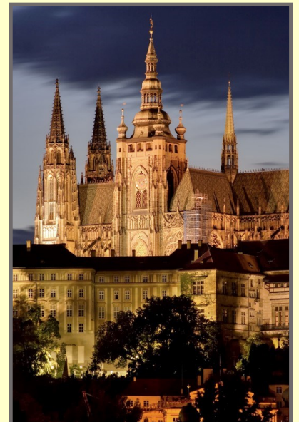
Prague Castle at Dusk