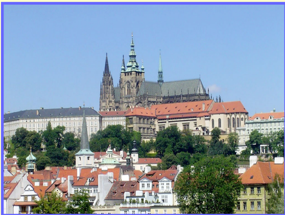
Prague Castle by day

Please join us for the full program in February. It will be colorful and interesting.