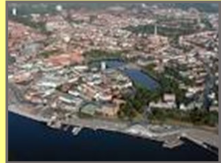
FNNC Exchange with FF of Kiel May 24- 31

Estimated cost for the entire 18 day experience is approximately $4000. This includes: airfare, transfers, Hamburg hotels, FF Kiel homestay & FFI fees, cruise leaving from Kiel, 2 cruise excursions, round-trip DIA shuttle, all gratuities, taxes and fees.