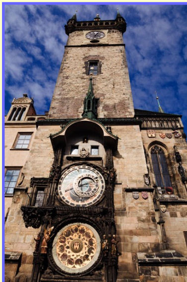
Prague Astronomical Clock