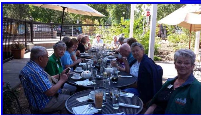
Dushanbe Tea House in Boulder