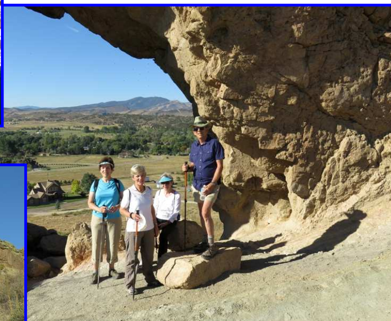
View of the Rockies through the Keyhole at Devil's Backbone