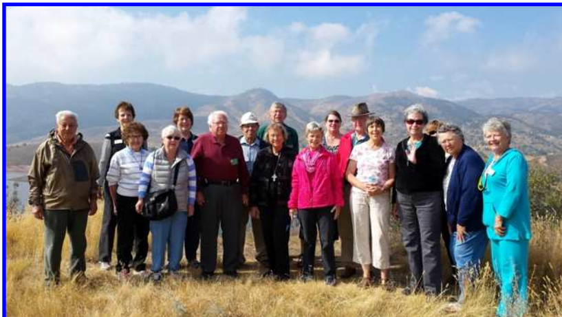
Magic Bus Tour of Fort Collins at Horsetooth Reservoir