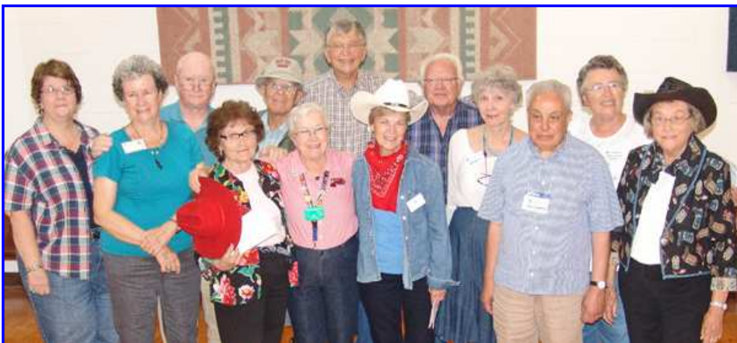
Ambassadors enjoy the Western Farewell Hoedown