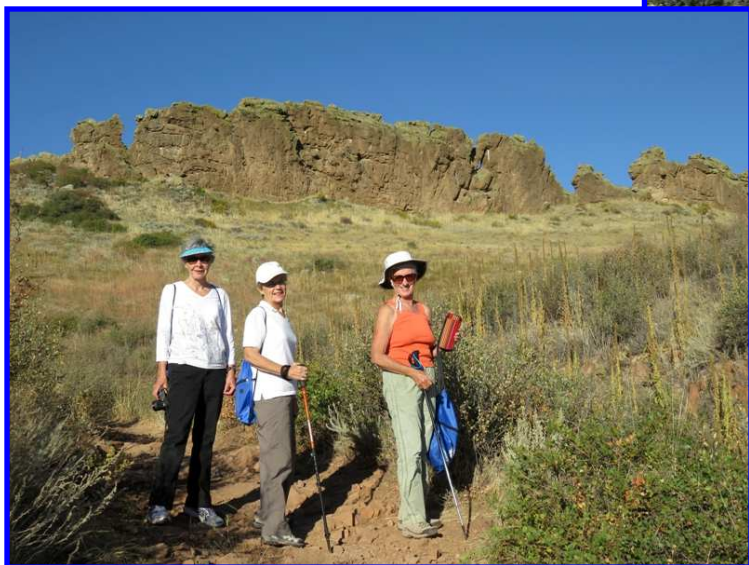
Hiking at the Devil's Backbone