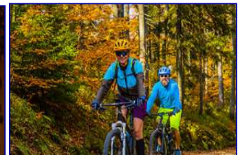
Escape to Wisconsin by Bike! Sept. 14-21, 2020