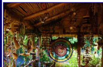
Discover Chile with FF La Serena Nov. 5-16, 2019

----- Interested in finding a FF Journey? There are dozens of possibilities on FFI website: Friendshipforce.org